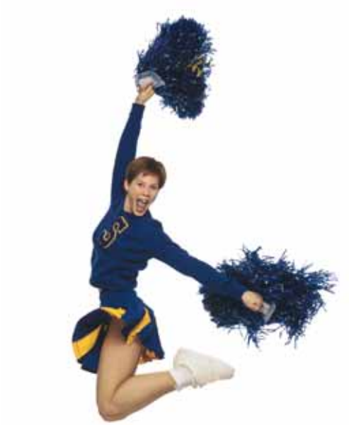
Figure 5: A good exercise regime can include any activity you enjoy!

So, what are you waiting for? Put on those walking shoes and take a brisk walk around the neighborhood. Not only will you be enjoying fresh air and exercise; you will be amazed at the things you see when you are not inside a car.