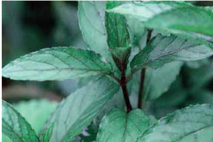
Figure 3: Peppermint.

In the randomized, double-blind, controlled trial, Kline et al of the University of Missouri-Columbia investigated the efficacy and clinical usefulness of pH-dependent, enteric-coated, peppermint oil capsules in the treatment of IBS symptoms in 42 children. The patients, between the ages of 8 and 17 years, were randomized to receive peppermint oil capsules (187 mg) or placebo (arachis oil) capsules for two weeks. Patients weighing more than 45 kg received two capsules tid and smaller children received 1 capsule tid. Clinicians ranked the severity of pain and change in symptoms on day 1 and day 14. The patients also completed a daily diary to report changes in severity of symptoms.