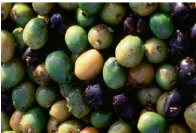
Figure 2: Saw Palmetto Berry .

Suggested use: 0.5-1-gm of dried berry or 0.6-1.5-ml extract daily.