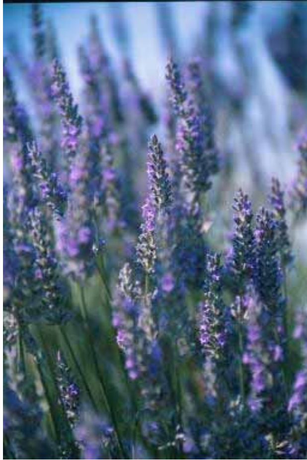
Figure 6: Lavender ( Lavandula angustifolia ) essential oil has been shown to assist with insomnia and stress. Don't confuse it with Lavandin ( Lavandula intermedia ), which has high levels of camphor and can be stimulating!