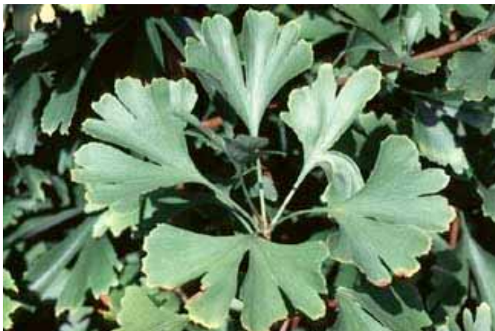
Figure 1: Ginkgo biloba .