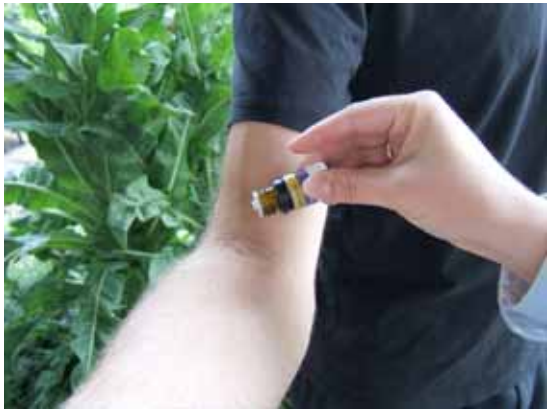
Figure 4: Always apply a skin patch test before direct application.

Essential oils can also be added to ethyl alcohol, apple cider vinegar, sea salt, or Epsom salts and rubbed on the body for a stimulating rub. This is a wonderful bonus to showering in the morning. Try mixing rosemary oil into a natural salt base with the addition of a cold-pressed sweet almond oil for an invigorating morning skin scrub.